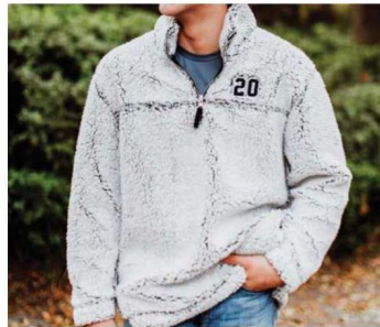
SHERPA 1/4 ZIP